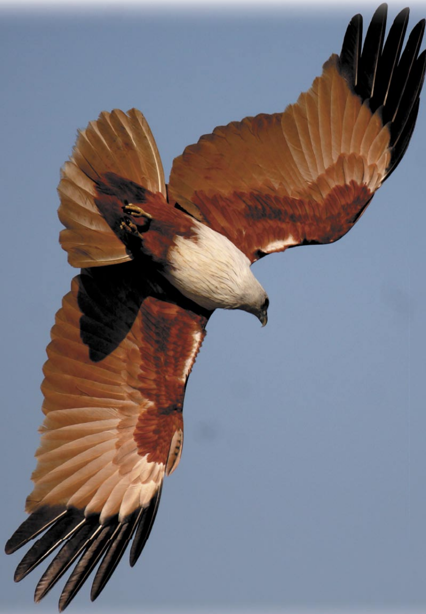
BRAHMINY KITE, ADULT