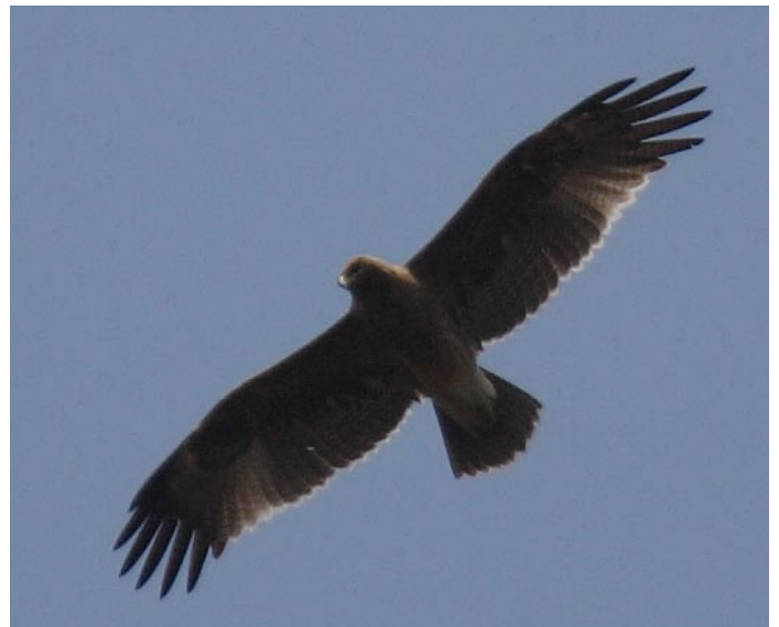
Indian Spotted Eagle 1K. Velim Lake. overside meget lig en ung steppeørn undersiden har stor skrigeørnetegning (lyse svingjer/mørke dækjer). Desuden har den et tydeligt gennemskinneligt lyst felt i de inderste håndsvingsjer. 6 tydelige ”fingre”.