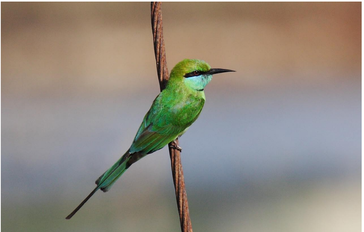
Little Green Bee-eater. Baga Fields.

Indian Peacock: 1, Little Green Bee-eater: 4, Common Iora: 3, Indian Robin: 1, Jungle Babbler: 10, Purple Sunbird: 1