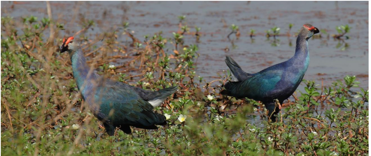
Purple Swamphen. Carambolim Lake.

Indian Oriole: 10, Small Minivet: 1, Black Drongo: 15, Ashy Drongo: 1, Asian Paradise Flycatcher: 1, Magpie Robin: 2, Stonechat (Siberian): 7, Chestnut-tailed Starling: 1, Jungle Myna: 75, Black-lored Tit: 1, Barn Swallow: 250, Wire-tailed Swallow: 15, Red-rumped Swallow: 25, Streak-throated Swallow: 6, Red-vented Bulbul: 2, Grey-breasted Prinia: 2, Plain Prinia: 15, Ashy Prinia: 8, Zitting Cisticola: 20, Blyth's Reed Warbler: 6, Common Tailorbird: 3, Greenish Warbler: 20, Malabar Crested Lark: 2, Flowerpecker sp: 5, Purple-rumped Sunbird: 4, Richard's Pipit: 3, Paddyfield Pipit: 2, Baya Weaver: 20, Black-headed Munia: 2 (han og hun).