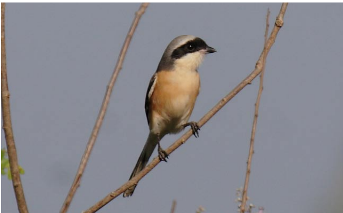
Bay-backed Shrike. Morjim Beach.

Common Kingfisher: 2, Stork-billed Kingfisher: 1, Greenshank: 5, Small Pratincole: 30, Black Kite: 50, White-Bellied Sea Eagle 2 ad, Booted Eagle: 1, Common Myna: 2