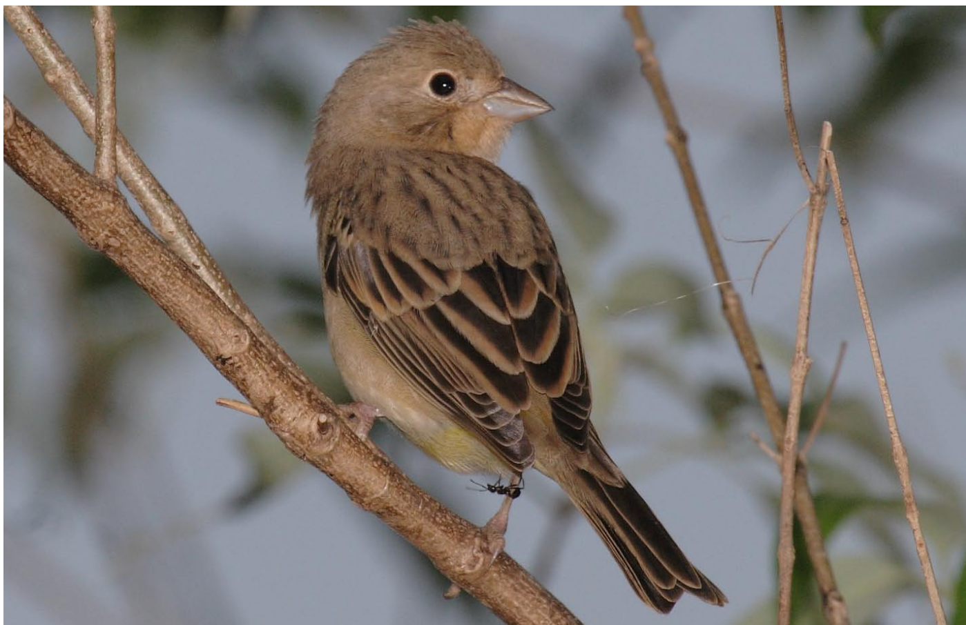
Black-headed Bunting, hun/IK. Tambdi Surla.