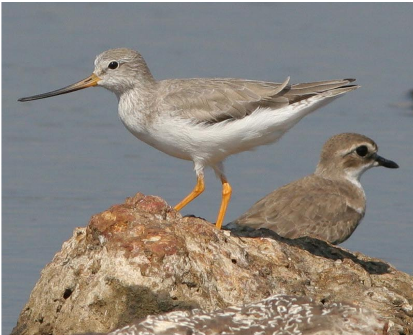
Terek Sandpiper and Lesser Sand Plover. Carambolim Fields.