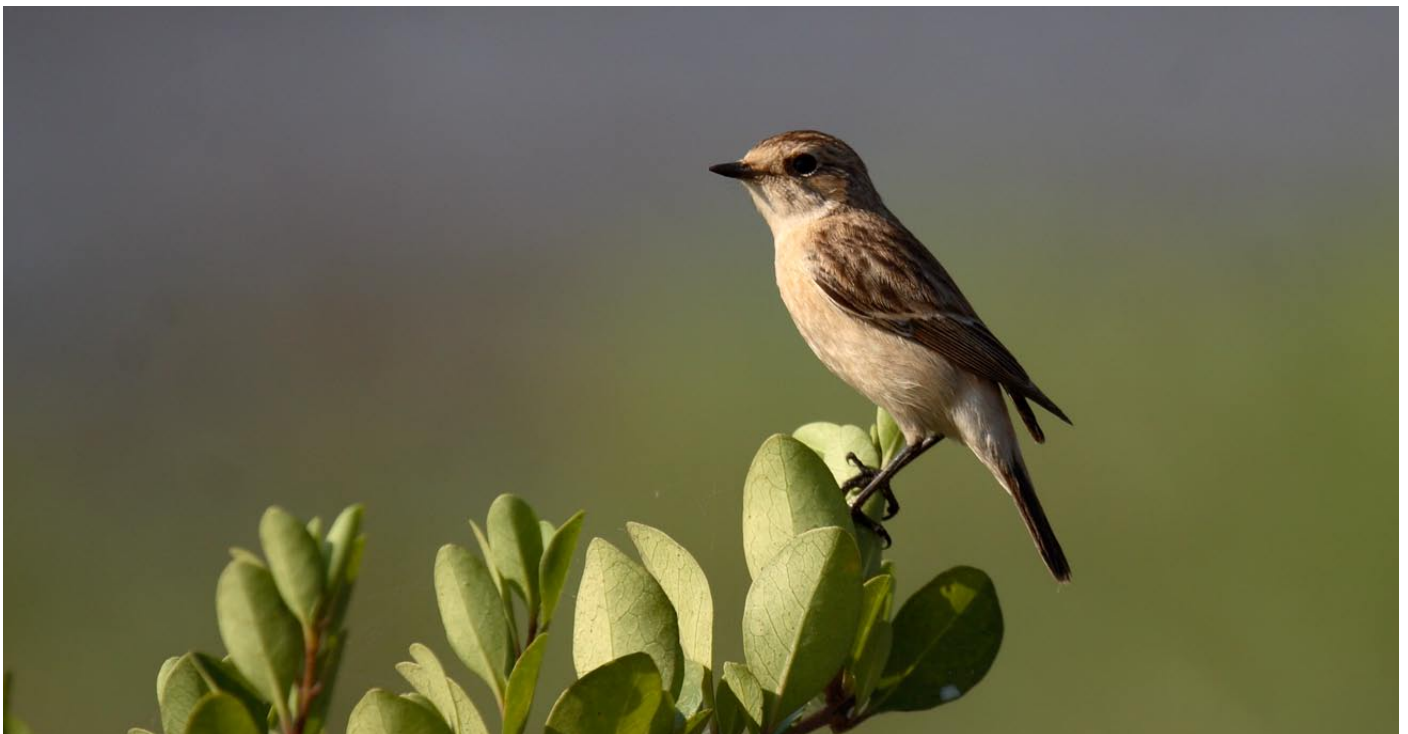
Sibirian Stonechat, hun. Carambolim Fields.