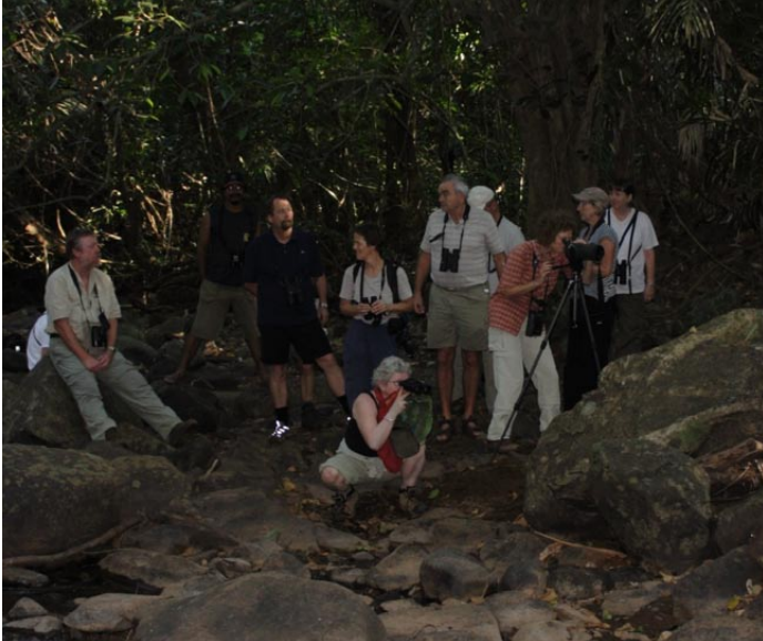
Kig på Blue-eared Kingfisher, Backwoods

Dag 6 – Pyh ha! I dag blev en lummer dag, temperaturen rundede 32 grader og store skyer tårnede sig op hen over dagen. Tidligt om morgenen, eller sent på natten om man vil, kunne der høres hele tre arter af ugler fra diverse telte i campen: Oriental Scops Owl, Brown Hawk Owl og lige ved daggry Jungle Owlet. Efter morgentekl 6.30 kørte vi ud til en skolegård, hvor der var en del blomstrende træer, som gav rigtig pænt med fugle, som kunne ses godt. Formiddagen bød på rovfugleobs hvor petroniaer, en Purple Sunbird ved rede og et par utrolig smukke gamle Høgeørne på tæt hold blev de helt store oplevelser. Efter frokostpause kørte vi til Tambdi Surla Temple – 10 minutter i templet og derefter en utrolig smuk tur ind i junglen og langs floden på udkig efter isfugle og den smukke Indiske Blå Nattergal (Indian Blue Robin). Aftenen sluttede med ginnies og beeries som vores lokale guide så smukt formulerede det. Selskabet brød op, da nogle af selskabets herrer brød ud i sang.