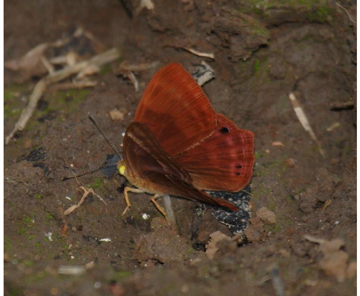
Sommerfugl, Backwoods.