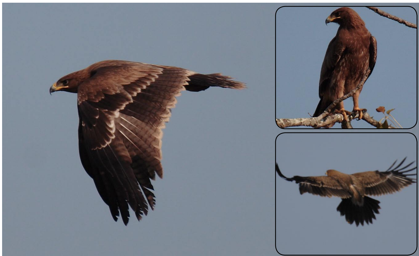
Tawny Eagle 3K. Carambolim Fields.