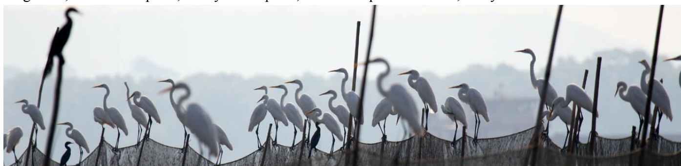
Great Egrets, River Zuari.

Black-rumped Flameback: 1, White-cheeked Barbet: 3, Cobbersmith Barbet: 1, Indian Roller: 2, Blue-tailed Bee-eater: 70, Little Green Bee-eater: 4, Common Kingfisher: 1, Smyrna Kingfisher: 5, Stork-billed Kingfisher: 1, Black-capped Kingfisher: 1, Pied Kingfisher: 2, Koel: 3, Plum-headed Parakeet: 1, House Swift: 20, Asian Palm Swift: 2, Common Snipe: 1, Painted Snipe: 3 (han, hun og juv/pull), Redshank: 2, Greenshank: 1, Green Sandpiper: 1, Wood Sandpiper: 18, Common Sandpiper: 3, Red-wattled Lapwing: 2, White-bellied Sea Eagle: 3 (2 ad + 1 imm), Marsh Harrier: 1, Little Cormorant: 1, Little Egret: 1, Intermediate Heron: 3, Cattle Egret: 11, Indian Pond Heron: 36, Grey Heron: 1, Purple Heron: 2, Little Heron: 2, Black-crowned Night Heron: 5, Long-tailed Shrike: 1, Ashy Woodswallow: 2, Indian Oriole: 1, Magpie Robin: 1, Chestnut-tailed Starling: 15, Rosy Starling: 30, Jungle Myna: 70, Common Myna: 1, Red-rumped Swallow: 30, Ashy Prinia: 1, Clamorous Reed Warbler: 1, Blyth's Reed Warbler: 3, Greater Short-toed Lark: 6, Malabar Crested Lark: 1, White-browed Wagtail: 3, Richard's Pipit: 6, Paddyfield Pipit: 2, White-rumped Munia: 35, Scaly-breasted Munia: 70