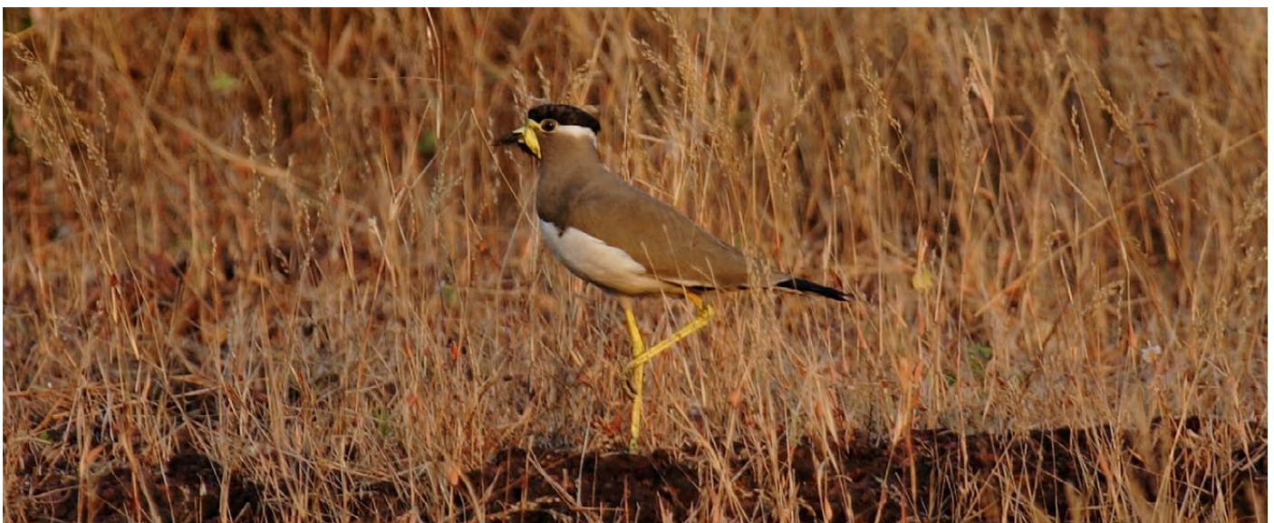
Yellow-wattled Lapwing, Dona Paula.

White-cheeked barbet: 1, Coppersmith Barbet: 1, Little Green Bee-eater: 4, Blue-tailed Bee-eater: 1, Koel: 1, House Swift: 150, Spotted Dove: 3, Red-wattled Lapwing: 1, Yellow-wattled Lapwing: 5, Black Kite: 10, Brahminy Kite: 2, Booted Eagle: 1, Shikra: 1, Cattle Egret: 1, House Crow: 30, Long-tailed Shrike: 2, Black Drongo: 2, Blue Rock Thrush: 1 han, Indian Robin: 6, Stonechat: 2, Rosy Starling: 17, Red-rumped Swallow: 5, White-browed Bulbul: 2, Plain Prinia: 1, Sykes Warbler: 1, Blyth's Reed Warbler: 2, Ashy-crowned Sparrow-lark: 10, Malabar Crested Lark: 1, Greater Short-toed Lark: 1, Oriental Skylark: 3, White-browed Wagtail: 2, Blyth's Pipit: 1, Tawny Pipit: 1, House Sparrow: 1, Bunting sp: 1