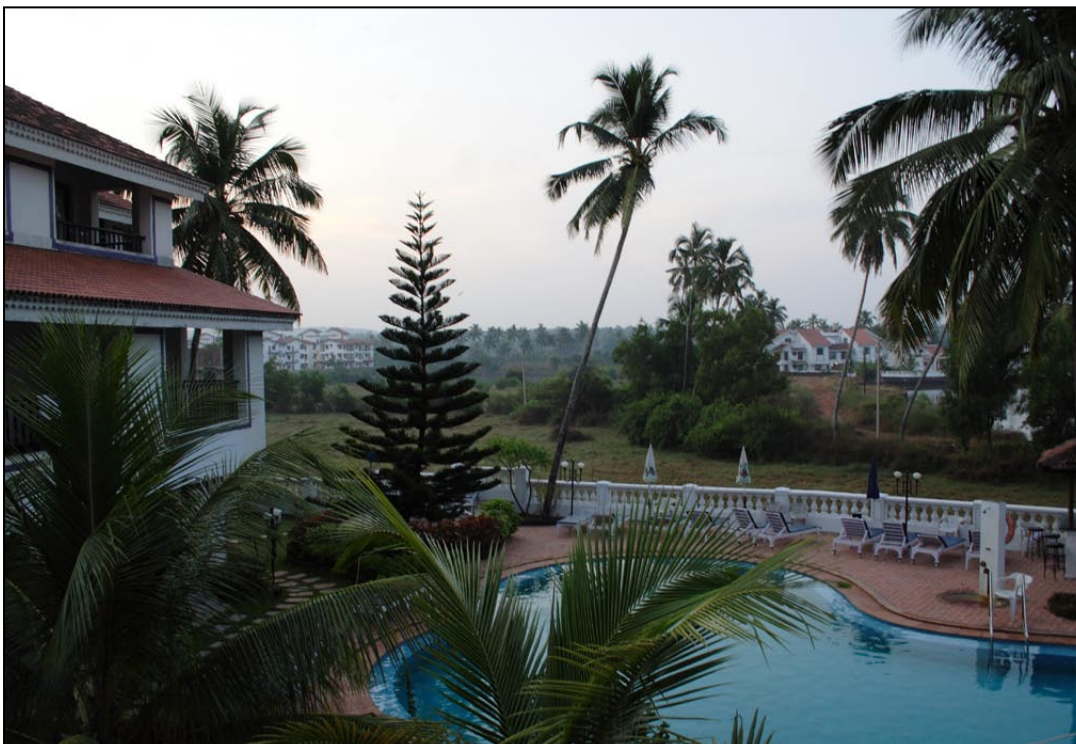
Udsigt fra værelset: Hotel Lagoa Azul kl 07.00