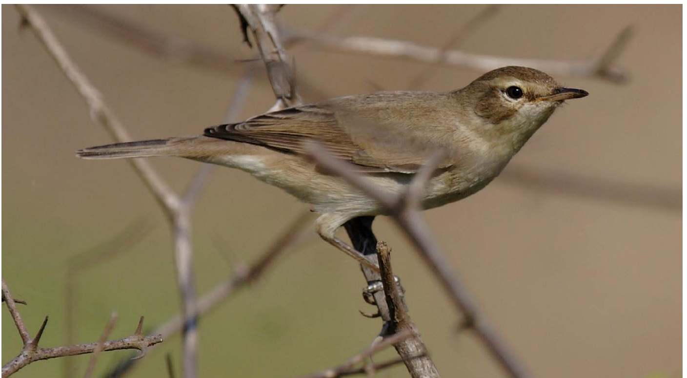
Booted Warbler - caligata. Morgim Beach.

Black-rumped Flameback: 1, White-cheeked Barbet: 1, Coppersmith Barbet: 1, Indian Roller: 1, Common Kingfisher: 6, Smyrna Kingfisher: 3, Black-capped Kingfisher: 1, Stork-billed Kingfisher: 1, Little Green Bee-eater: 3, Blue-tailed Bee-eater: 14, Koel: 3, Asian Palm Swift: 2, Spotted Owlet: 2, Spotted Dove: 2, White-breasted Waterhen: 6, Ruddy Crake: 1, Ballion's Crake: 1, Rail sp: 1 (Tim Andersen), Pintail Snipe: 1, Common Snipe: 1, Painted Snipe: 3, Redshank: 1, Wood Sandpiper: 15, Green Sandpiper: 1, Common Sandpiper: 3, Little Ringed Plover: 1, Red-wattled Plover: 4, Marsh Harrier: 2, Little Cormorant: 3, Indian Pond Heron: 15, Purple Heron: 1, Little Heron: 4, Black-crowned Night Heron: 1 ad, Long-tailed Shrike: 2, Ashy Woodswallow: 2, Chestnut-tailed Starling: 20, Rosy Starling: 1, Zitting Cisticola: 3, Paddyfield Warbler: 1-2, Blyth's Reed Warbler: 2, Malabar Crested Lark: 2, Purple-rumped Sunbird: 2, Paddyfield Pipit: 4, Richard's Pipit: 2, White-rumped Munia: 25, Scaly-breasted Munia: 1