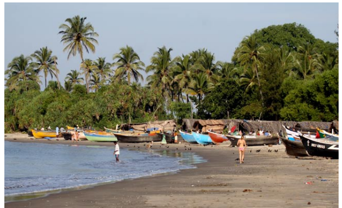
Morjim Beach.