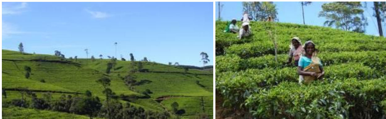
Ceylon tea in highlands of Sri Lanka

Accommodation – Leisure Village, Nuwara Eliya