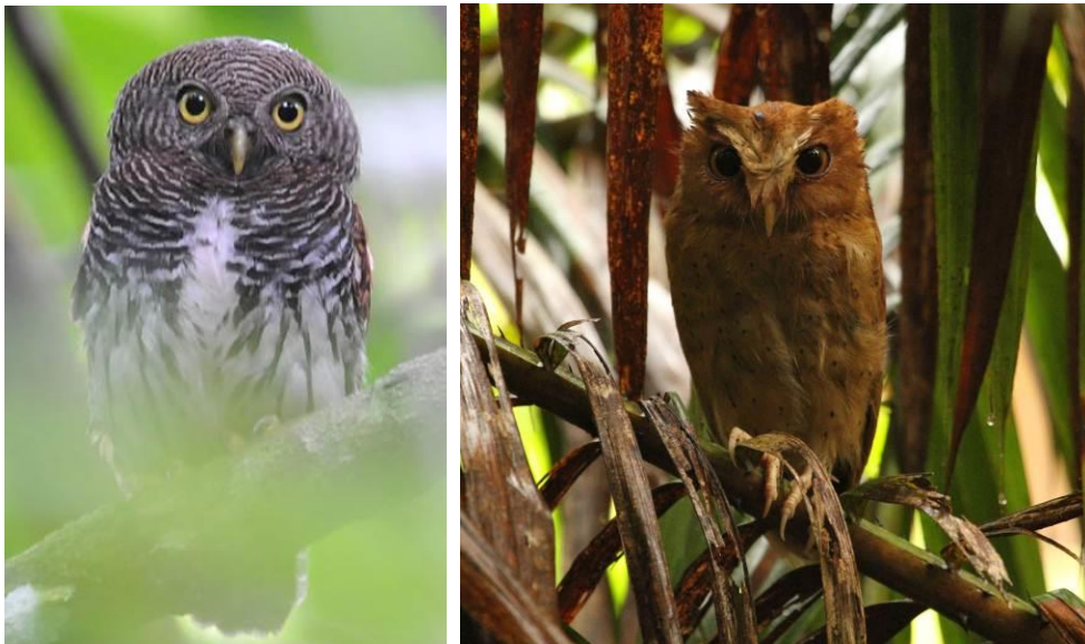
Chestnut Backed Owlet and Serendib Scopes Owl

After breakfast, if river levels permit, we may be ferried across the river by dug-out canoe or walk through a hanging bridge to explore Kitulgala's quiet forest trails, which are home to such exciting endemics as the tiny Sri Lankan Hanging Parrot, Yellow-fronted Barbet, Orange-billed Babbler and Sri Lankan Grey Hornbill. As well as these unique Sri Lankan residents, the area is rich in other bird life with the shy (but noisy!) Black Bulbuls, Black rumped Falme back Woodpecker, Crested Goshawk and Crested Treeswifts to watch for as Indian Swiftlets swirl overhead.