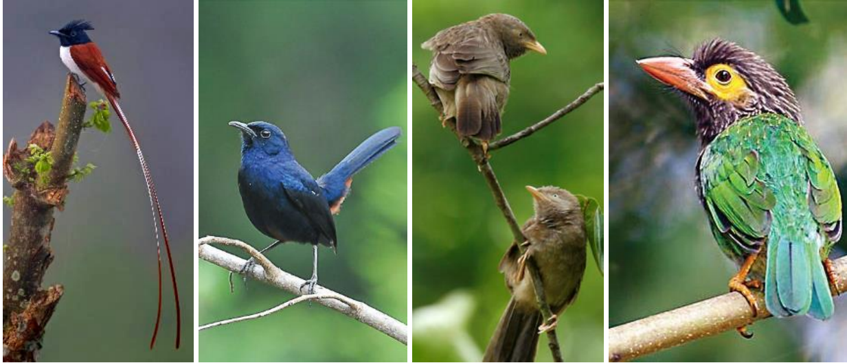
Photo - Paradise Flycatcher / Indian Black Robin / Yellow billed Babbler / Brown headed Barbet