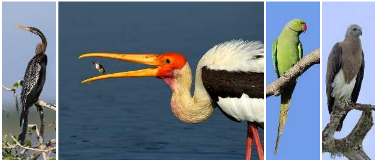
Indian Darter / Painted Stork / Rose ringed Parakeet / Grey headed Fish Eagle