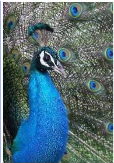
Elephant / Malabar Pied Hornbill / Crested Hawk Eagle / Indian Pea Fowl

Mugger Crocodiles frequent the river banks and, as we explore through the southern sector of the park, we'll find plenty of Tufted Grey Langurs as we watch eagerly for mammals such as Sambar and Spotted Deer. Leopards are probably easier to see here than anywhere else in Asia, and Yala is world famous for its large population of this most beautiful 'big cat'. With luck, we should have at least one encounter during our stay here. Sloth Bear is also common in the park, but less easily seen.