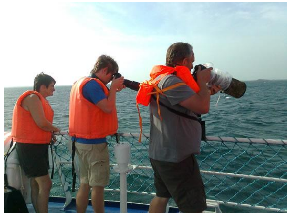
Whale watching in south coast