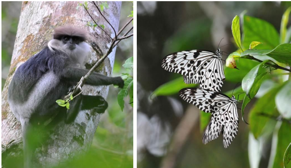
Purple faced Leaf Monkey and Sri Lanka Tree Nymph Butterfly

Accommodation – Leisure Village, Nuwara Eliya