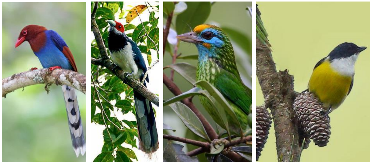
Sri Lanka Blue Magpie / Red faced Malkoha / Yellow fronted Barbet / White throated Flowerpecker

Accommodation – Blue Magpie Lodge, Sinharaja village