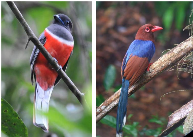
Malabar Trogon and Sri Lanka Blue Magpie

Accommodation – Blue Magpie Lodge, Sinharaja village