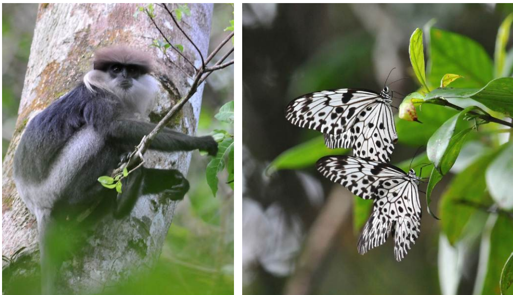
Purple faced Leaf Monkey and Sri Lanka Tree Nymph Butterfly

Accommodation – Galway Forest Lodge, Nuwara Eliya