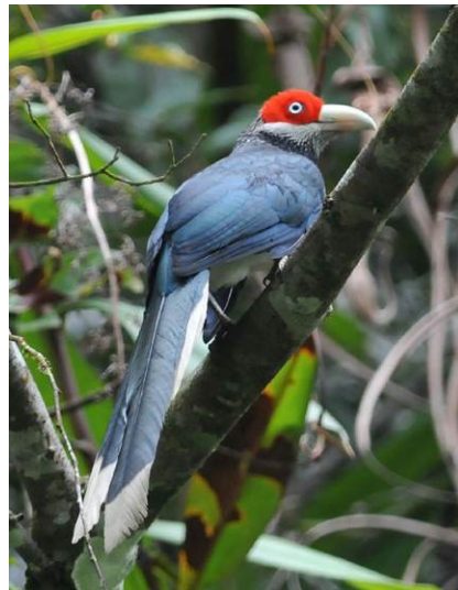
Tickle's Blue Flycatcher and Red Faced Malkoha