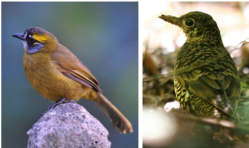
Yellow Eared Bulbul and Sri Lanka Scaly Thrush

Accommodation – Galway Forest Lodge, Nuwara Eliya