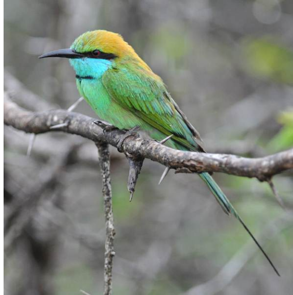
Greater Thick-knee and Green Bee-eater