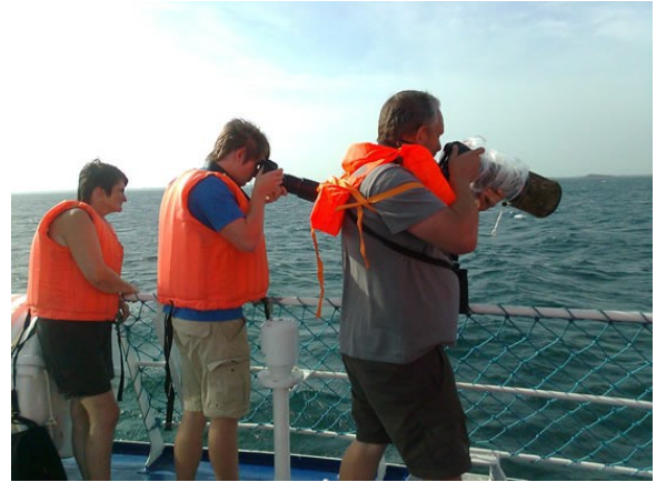
Whale watching in south coast

Accommodation – Fisherman Bay Hotel, Weligama