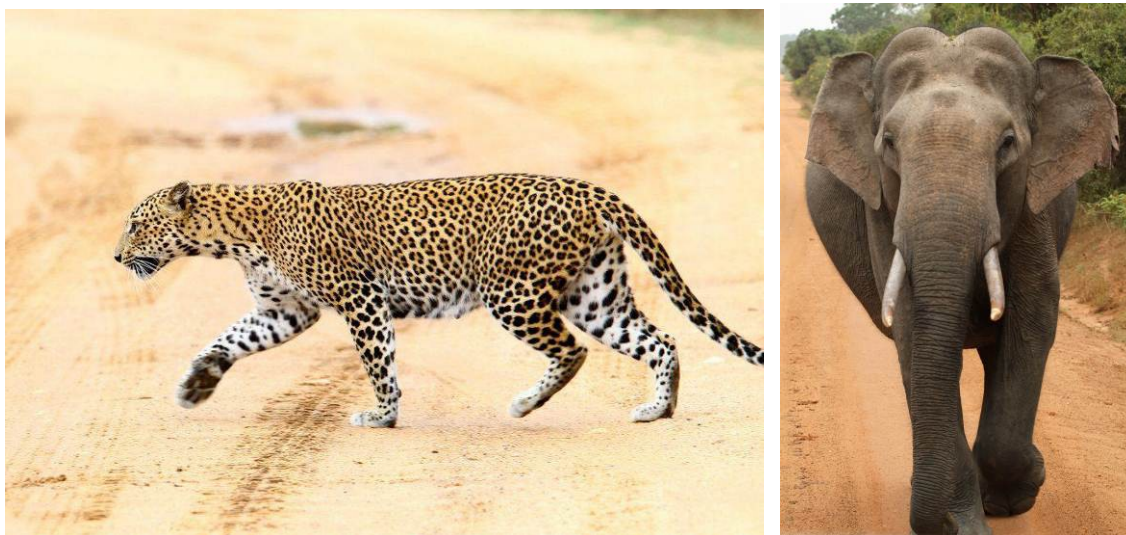
Sri Lanka Leopard and Asian Elephant

Accommodation – Hibiscus Garden Hotel, Tissamaharama