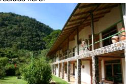
Day 09-February 17<sup>th</sup>: Transfer to Bosque de Paz. Overnight at Bosque de Paz lodge. (B/L/D)