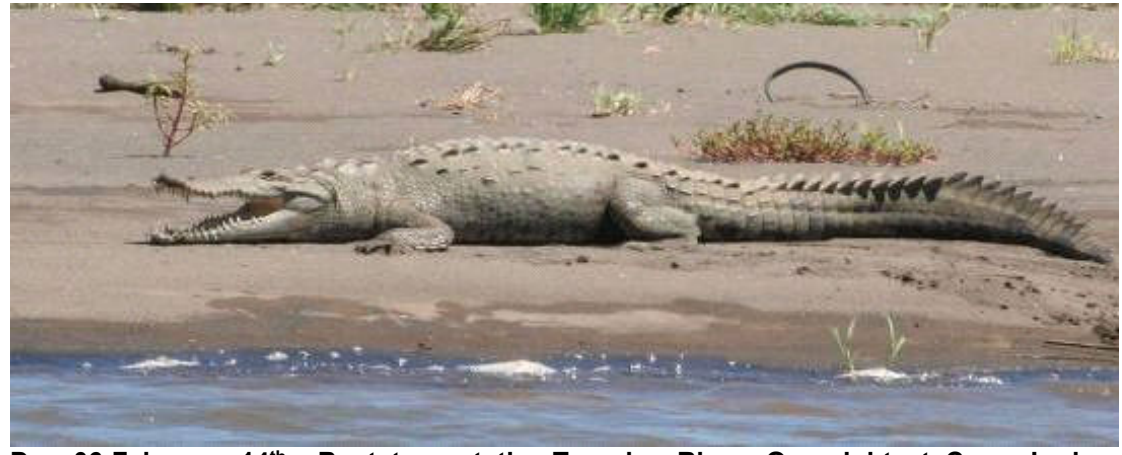
Day 06-February 14<sup>th</sup>: Boat tour at the Tarcoles River, Overnight at Cerro Lodge. (B,L,D)

Cerro Lodge is an environmental friendly project located in a farm in Tarcoles (Central Pacific). This area is one of the most important refuges of the scarlet macaw in Costa Rica.