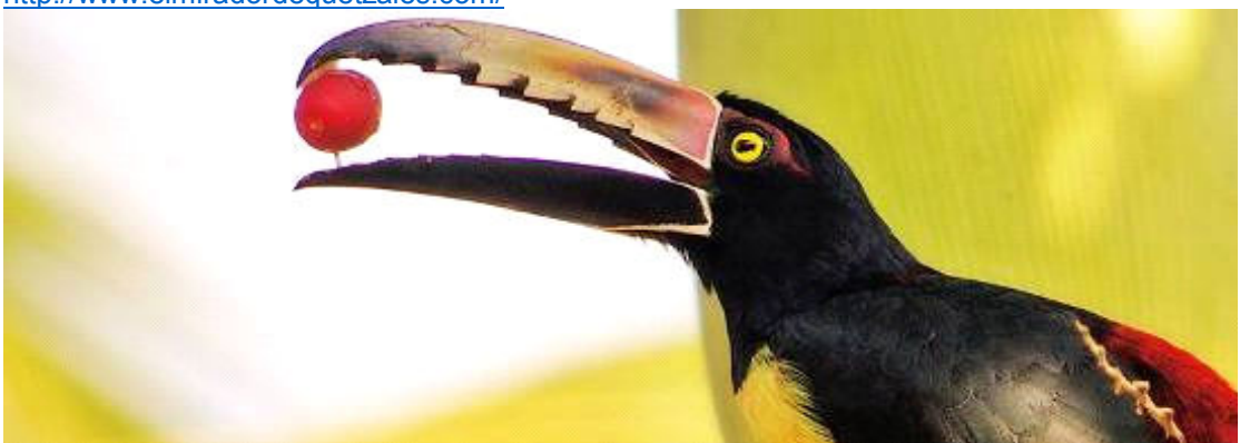
Day 03-February 11<sup>th</sup>: Transportation to Rancho Naturalista. Overnight at Rancho Naturalista (B/L/D).

The lodge is situated in 50 hectares (125 acres) of protected primary pre-montane Caribbean slope rainforest. Here, the habitats within the grounds include semi-wooded pastures and seasonal mountain streams. The extensive network of good trails provides access to diverse sections of the forest, these trails range from easy to more strenuous although the birding