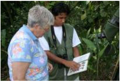
Day 12-February 20th: Early birding tour/ OV: La Selva Biological Station (B/L/D)

La Selva is located just 2 miles (3 km) south of Puerto Viejo de Sarapiquí. From San José, it can be accessed from the Guápiles Highway (Hwy 32). Head east from the capital, then take the Hwy 4 exit passing north through the town of Las Horquetas until you reach the park entrance on the left hand side.