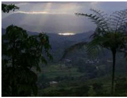
Day 04-February 12th: Rancho Naturalista in the Caribbean (B/L/D).

Today (your can organize early morning bird watching tour with your guide) explore various trails looking for the over 450 species of birds have been recorded in the area. These birds may be sampled from this comfortable lodge famous for its excellent food, welcoming hospitality and stunning volcano views.