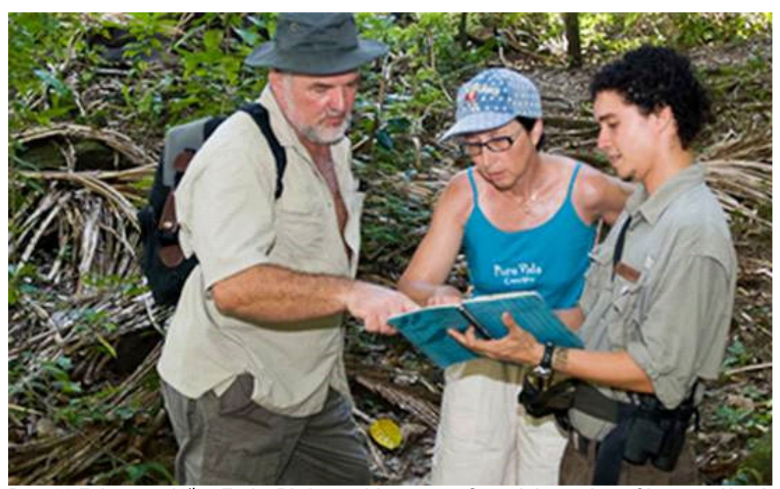
Day 08-February 16<sup>th</sup>: Early Bird watching tour, Overnight at Los Cipreses Hotel. (B/L/D)

On the other side of town you'll find the slightly smaller, and higher, Santa Elena Cloud Forest Reserve which has views of the Arenal Volcano. Other popular activities in the area include the canopy tours, visits to the butterfly garden, the suspension bridges tour, horseback riding, a visit to the cheese factory and the hummingbird galleries found at the entrances to both reserves.