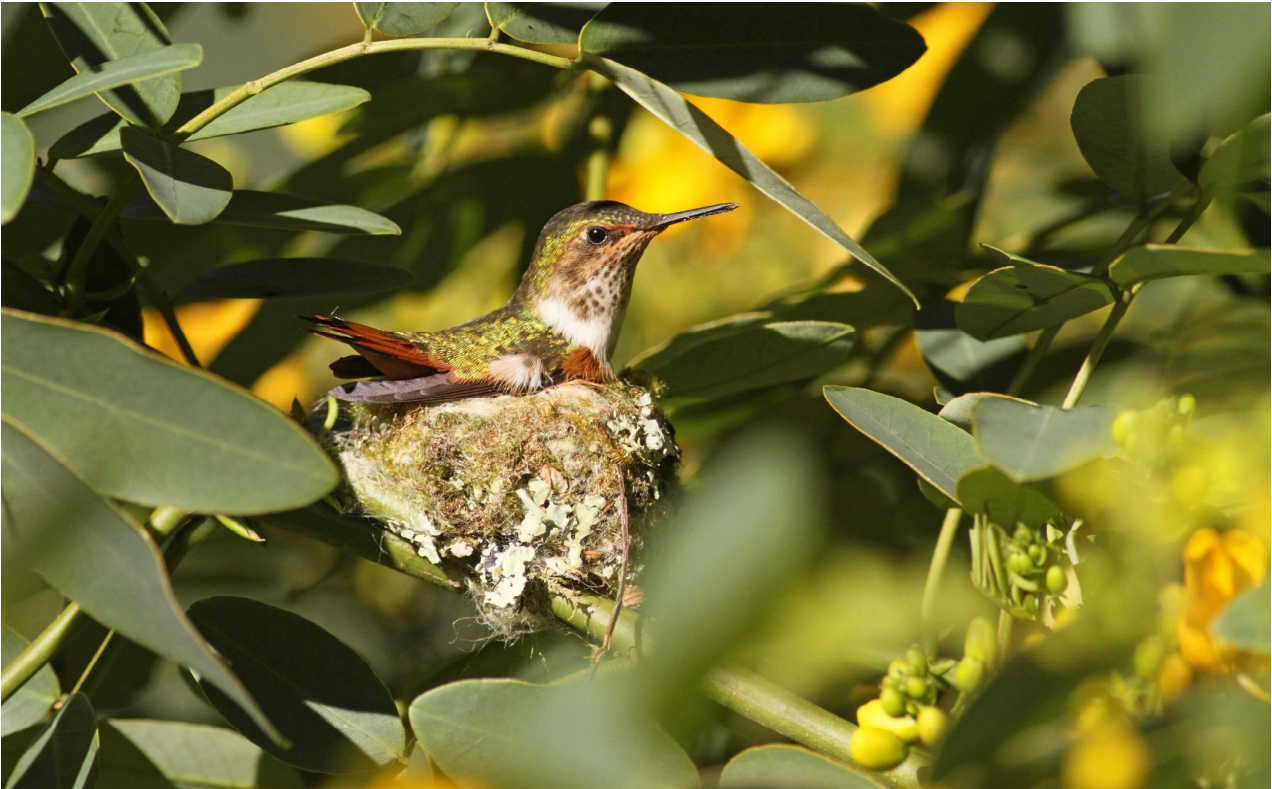
Scintillant Hummingbird

GARTERED TROGON Trogon caligatus Violethovedet Trogon 2 La Selva 15/2, 4 Cerro Lodge, Tarcoles 19/2.