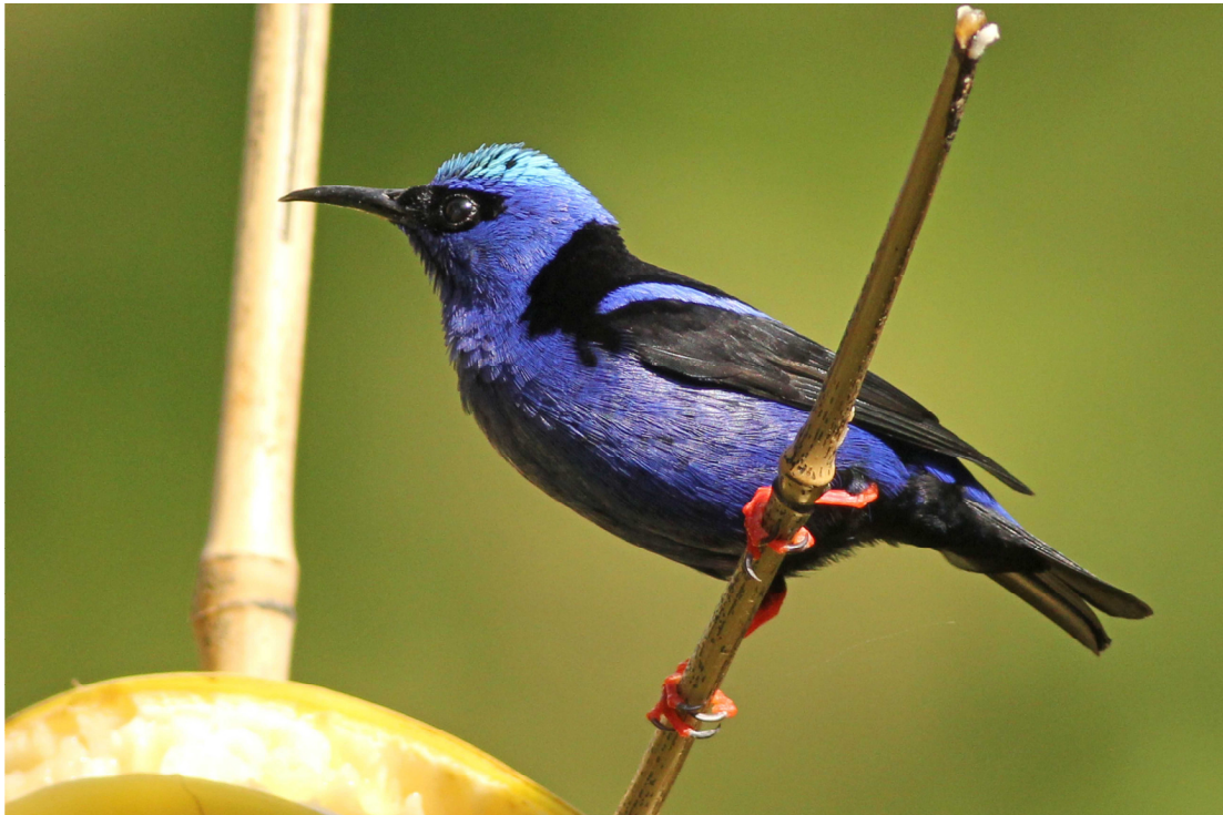
Red-legged Honeycreeper

RED-LEGGED HONEYCREEPER Cyanerpes cyaneus Rødbenet Honningsuger 1 male Celeste Mountain Lodge and surroundings 10/2, 1 12/2, 1 Canias-Monteverde 12/2, 6 San Isidro 18/2, 2 Surroundings near Cerro Lodge 20/2,