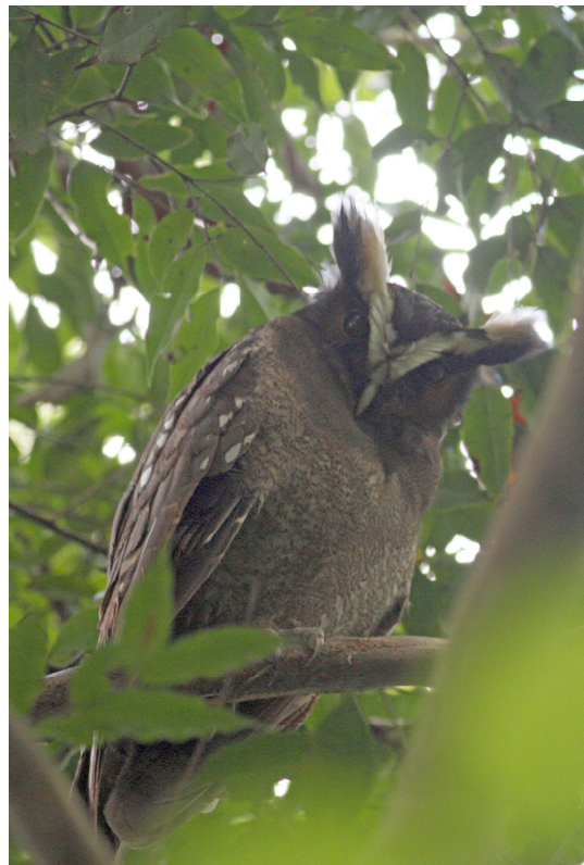
Mottled Owl and Crested Owl

LESSER NIGHTHAWK Chordeiles acutipennis Gråvinget Nathøg 20 Cerro Lodge, Tarcoles 19/2.