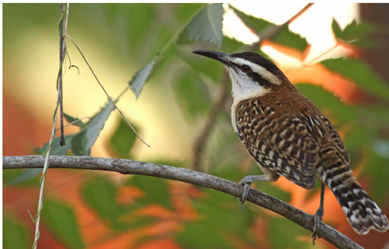
Rufous-naped Wren

3 Alajuela-Punta Morales 9/2, 2 Punta Morales-Tenorio Volcano N.P. 9/2, 2 Canias-Monteverde 12/2, 6 Surroundings near Cerro Lodge 20/2, 1 El Martino Boutique Hotel &amp; Spa, San Jose 22/2.