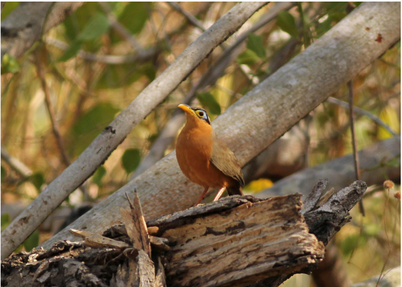
Lesser Ground Cuckoo