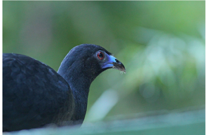
Black Guan

BLACK GUAN Chamaepetes unicolor Sort Penelopehøne 1 Savegre Mountain Lodge, San Gerardo de Dota Valley 17/2, 3 Bosque de Paz 20/2, 2 21/2.