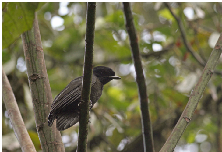
Bare-necked Umbrellabird

1 Universidad Nacional de San Isidro 18/2.