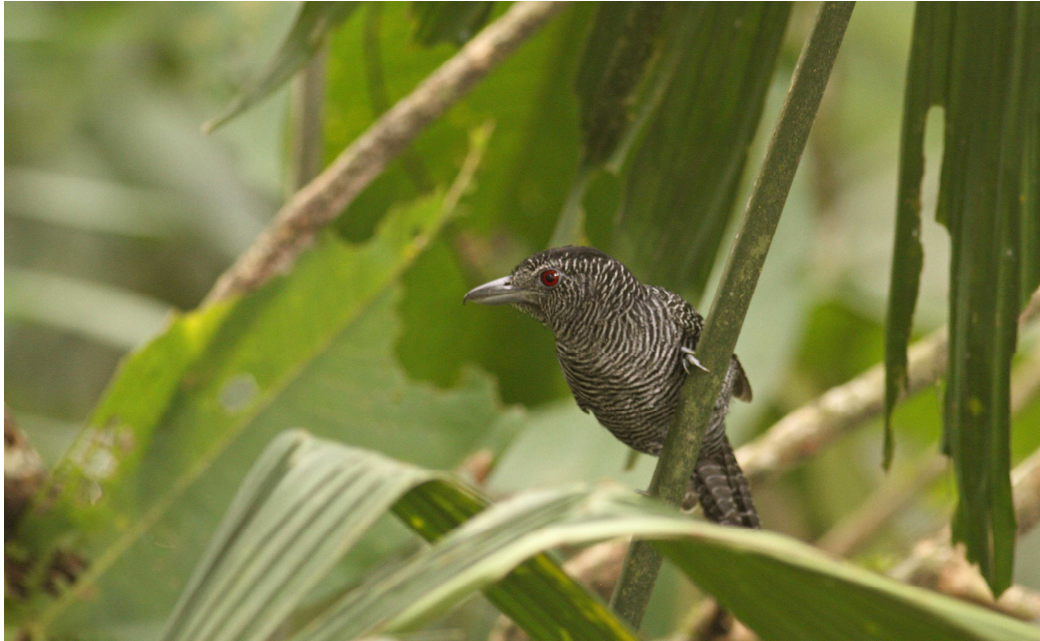
Fasciated Antbird, Photo: Jesper Sonne

FASCIATED ANTSHRIKE Cymbilaimus lineatus Båndmyretornskade 2 La Selva 15/2.