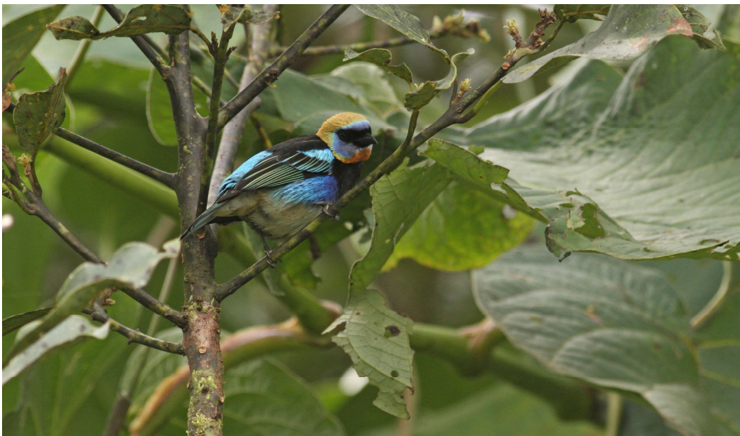
Golden-hooded Tanager, Photo: Jesper Sonne

GOLDEN-HOODED TANAGER Tangara larvata Blåmasket Tangar 1 Celeste Mountain Lodge and surroundings 10/2, 1 12/2, 2 Hotel Tilajari, Fortuna 14/2, 1 La Selva 15/2, 1 Universidad Nacional de San Isidro 18/2,