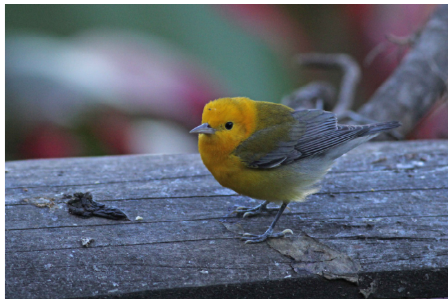
Prothonotary Warbler

2 Punta Morales 9/2, 1 Cerro Lodge, Tarcoles 19/2, 2 Catarata del Toro waterfalls 21/2,