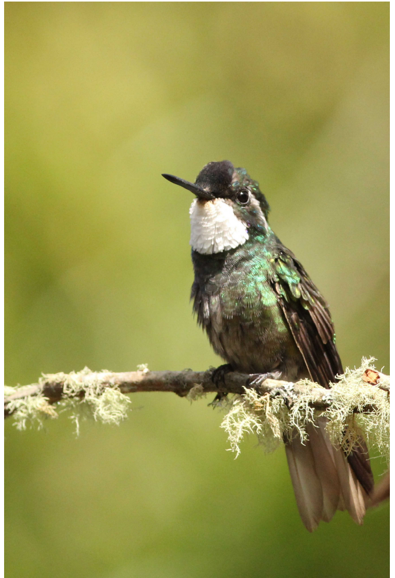
White-throated Mountain Gem

Archilochus colubris Rubinstrube 1 Punta Morales 9/2, 1 Canias- Monteverde 12/2, 1 Surroundings near Cerro Lodge 19/2, 1 20/2.