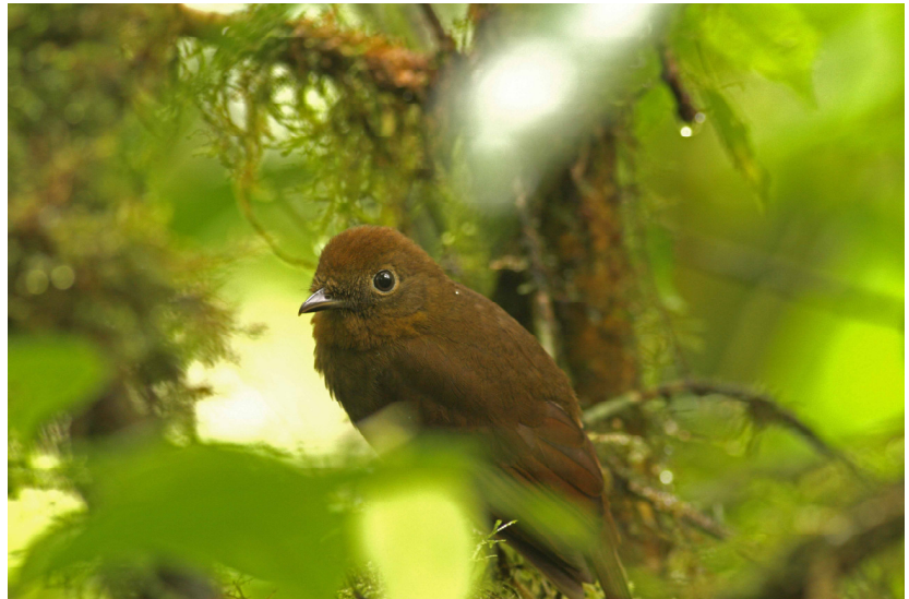
Thrushtlike Schiffornis

1 Punta Morales 9/2, 2 Cerro Lodge, Tarcoles 20/2.