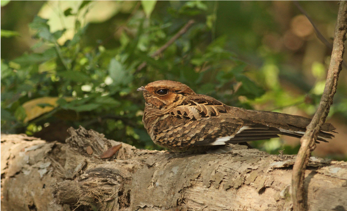
Common Pauraque, Photo: Jesper Sonne

1 Celeste Mountain Lodge 9/2, 10 11/2, 2 Cerro Lodge, Tarcoles 18/2, 1 River Trail Carara National Park 19/2, 1 Surroundings near Cerro Lodge 20/2, 1 El Martino Boutique Hotel & Spa, San Jose 21/2.