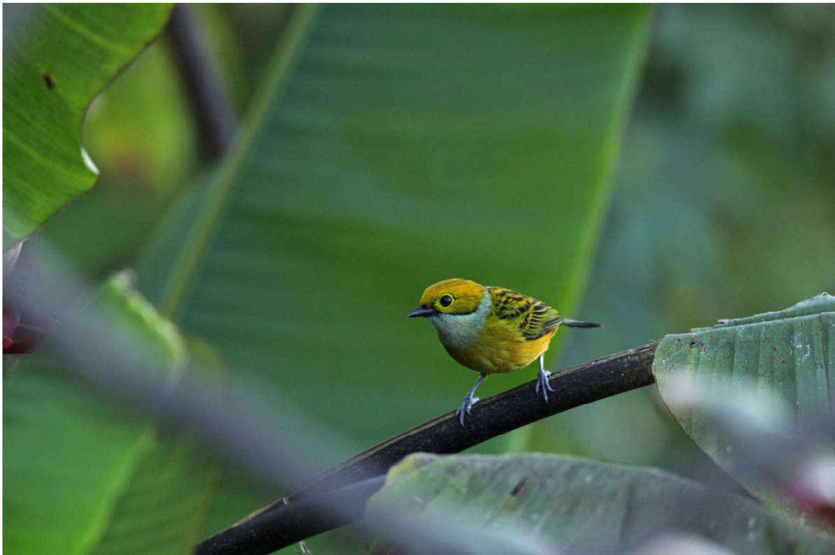
Silver-throated Tanager, Photo: Ivan Olsen

SILVER-THROATED TANAGER Tangara icterocephala Sølvstrubet Tangar 1 Celeste Mountain Lodge and surroundings 10/2, 1 12/2, 1 Hummingbird Garden Monteverde 13/2, 1 Savegre Mountain Lodge, San Gerardo de Dota Valley 17/2, 2 Bosque de Paz 21/2, 3 Catarata del Toro waterfalls 21/2,