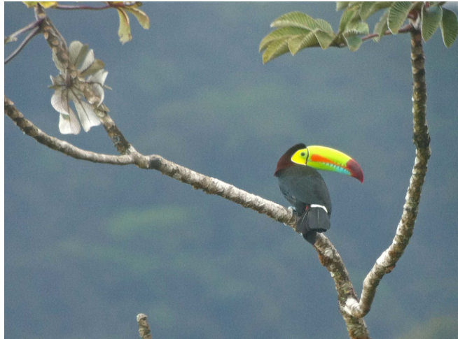
Keel-billed Toucan.

1 heard Celeste Mountain Lodge and surroundings 10/2, 1 Bijagua town 11/2, 2 Fortuna-La Selva 14/2, 7 La Selva 15/2, 1 Tirimbina Biological Reserve, Sarapiquí 16/2, 1 Tinamaste-Tarcoles 18/2, 1 Universal Trail Carara National Park 19/2, 1 Catarata del Toro waterfalls 21/2.