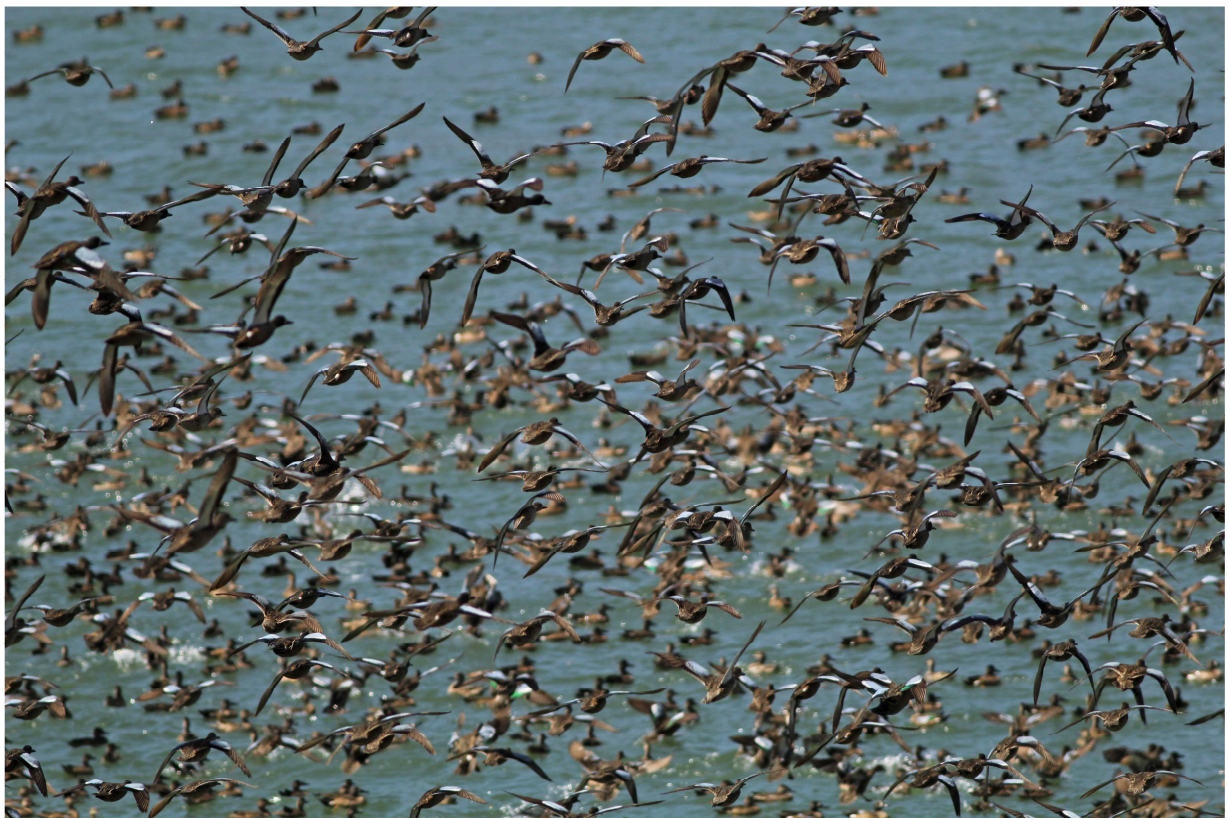
Blue-winged Teal, Photo: Ivan Olsen

Many thousands estimated 40-60,000 Dam by Sandillal 12/2.