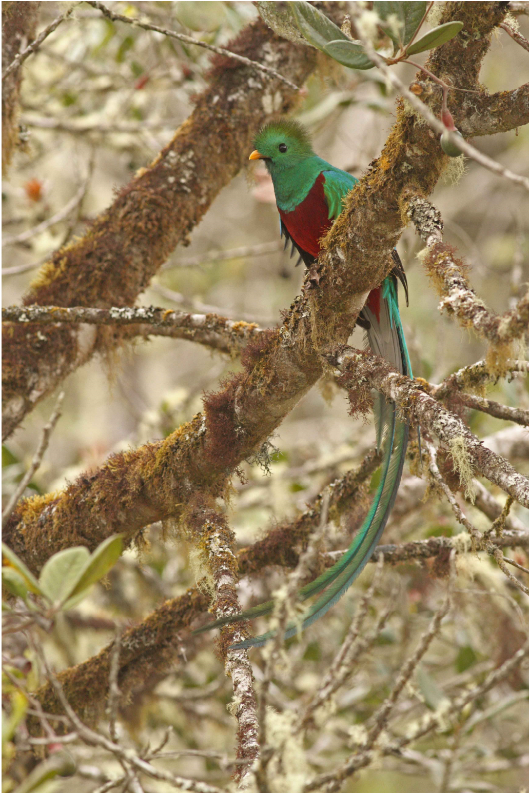
Resplendent Quetzal, Photo: Jesper Sonne

AMAZON KINGFISHER Chloroceryle amazona Amazonstødfisker 2 Tirimbina Biological Reserve, Sarapiquí 16/2, 1 Tinamaste-Tarcoles 18/2, 1 Tarcoles River 19/2.